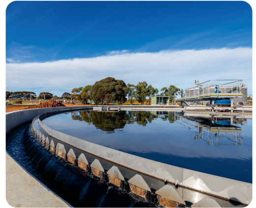
Melton Recycled Water Plant

Learn more about recycled water at gww.com.au