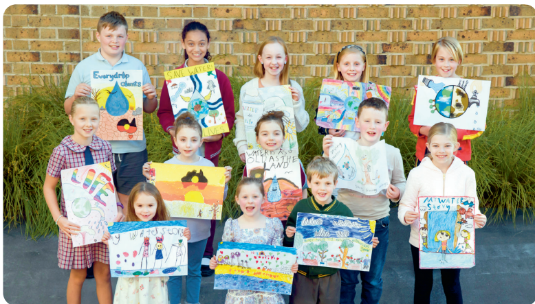
Our 2022 poster competition winners.

You can see the results at gww.com.au/nww and join in the fun in October 2023.